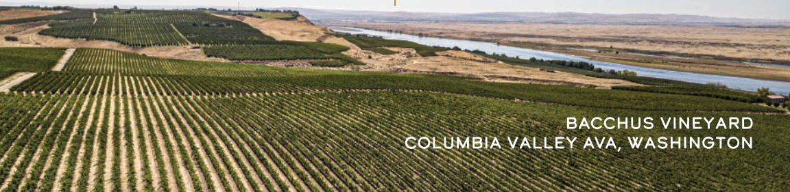
BACCHUS VINEYARD COLUMBIA VALLEY AVA, WASHINGTON

70% Columbia Valley 23% Red Mountain 7% Walla Walla Valley